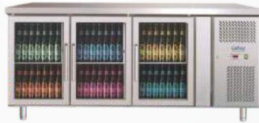
Undercounter Back Bar (GN 3100 TNG)