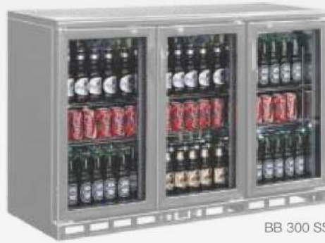
BB 300 SS

High performance Back Bars with refrigerated display, available in elegant black colour and stainless steel that can be specified as part of a complete bar solution or individually.... giving you endless possibilities in bar design. They create maximum display area and allow rapid restocking and cooling. Black Back Bars are highly cost-effective too.