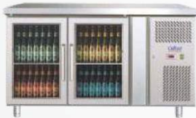
Undercounter Back Bar (GN 2100 TNG)

Elegant yet reliable Undercounter Back Bars made in sturdy stainless steel that are designed to enhance the efficiency of professional bartenders. Perfect for showcasing bottled and canned drinks and giving you high capacity & high visibility storage and display options.