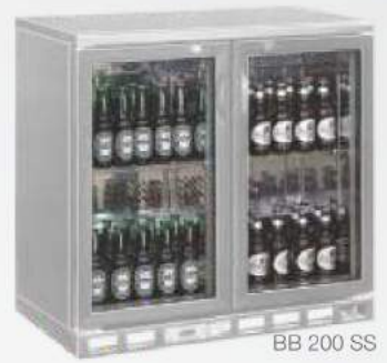
BB 200 SS