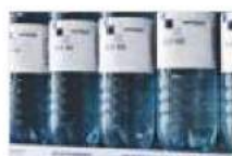
Stable and strong shelves

You have the possibility to choose an accessory lock that prevents unauthorized access to the products.