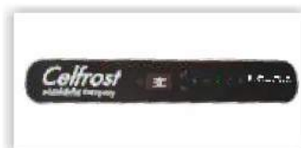
Digital temperature display