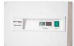
Solar driven display