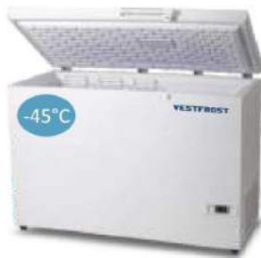
VT 147 VT 307

These Vestfrost low temperature freezers create the possibility to maintain temperatures as low as -45°C (VT 147 & VT 307), upto -60°C (VT 407) and upto -86°C (VT 78 & VT 408). Supreme stability, reliability, user-friendliness and ease of cleaning make these freezers an ideal solution for laboratories and hospitals. Nature R refrigerant, cyclopentane insulation combined with recyclable materials make the freezers extremely eco-friendly.