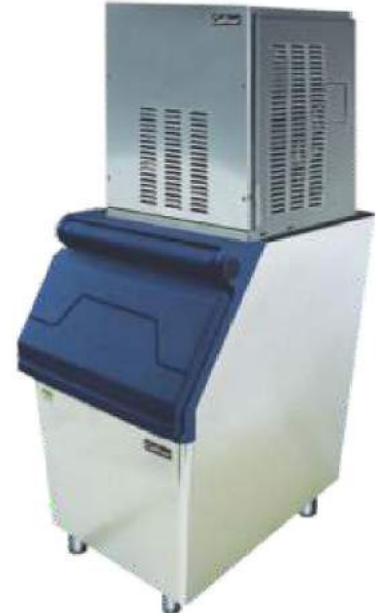
IF-200 on IB-105 Bin