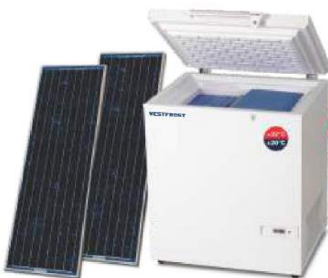
MKS 044 with Solar Panels*

Based on the unique SolarChill ice bank technology, the Vestfrost MKS 044 functions safely without use of energy storing batteries or contaminating fuel. Solar panels supply the necessary power and the icebank provides a reliable temperature in the vaccine compartment – even when the sun is absent for days. The temperature is controlled and maintained via self-regulating convection between icebank and vaccine compartment.