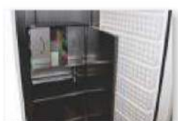
Internal Lids + Shelves