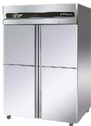
GN 1410TNM (New) / GN 1410BTM (New)