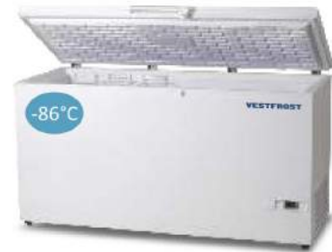
VT 78 VT 408