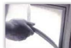
Removable door gasket for easy cleaning