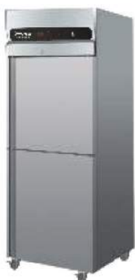
GN 650TNM (New) / GN 650BTM (New)

These rugged refrigerators and freezers in stainless steel from Celfrost come with an automatic defrost mechanism and auto shut doors for energy efficiency.