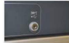
USB Data Logging

Easy view of the cabinet temperature. Temperatures history with the illustrative graph chart can be generated on the screen. Temperature data can be downloaded with the USB data logging system. In case of power failure, the optional battery back-up system will notify about temperature fluctuations up to 48 hours.