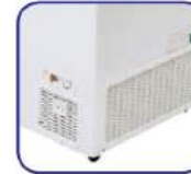
3 Side Air Circulation For Better Heat Transfer