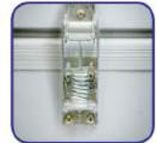
Patented Noise Free Hinges