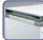
Sleek Recessed Handle

Super tropicalised to perform in extreme temperatures