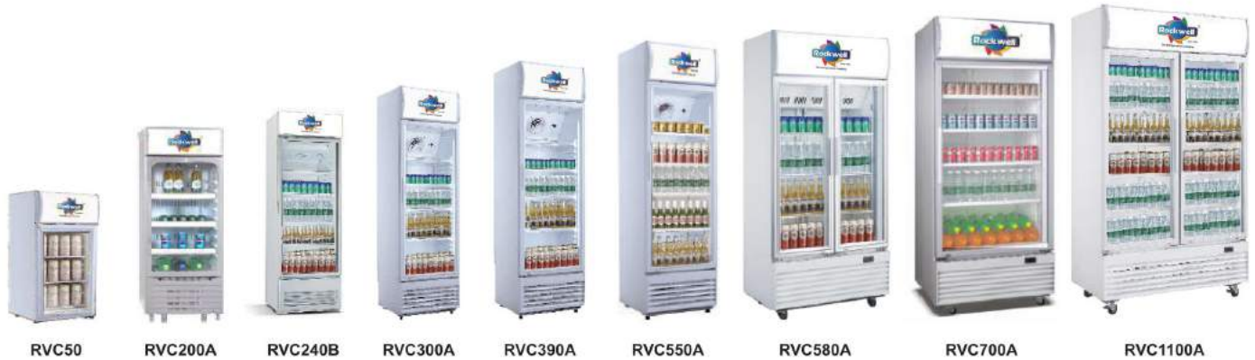
RVC50 RVC200A RVC240B RVC300A RVC390A RVC550A RVC580A RVC700A RVC1100A