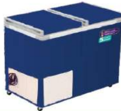
PC 21 DD